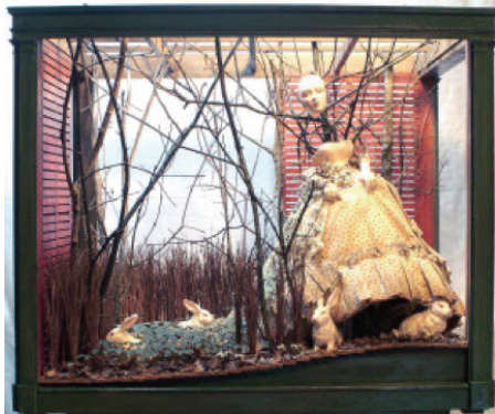
Briar Patch by Michael Vaughn Sims

Our final product will be a Media Arts production your choice: either a stop-motion video of puppets in action or a live video of your original content-based play (in person or in puppets) in action.